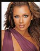
Vanessa Williams American Singer & Actress