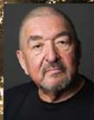
Graham Greene Academy Award Nominated Actor