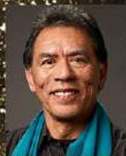
Wes Studi Oscar Winner Native American Actor